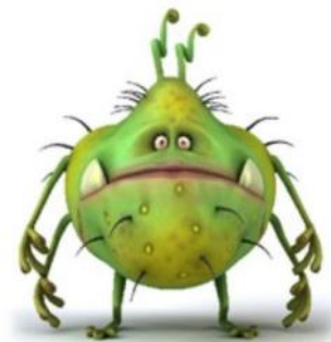
Ugh the Bug!